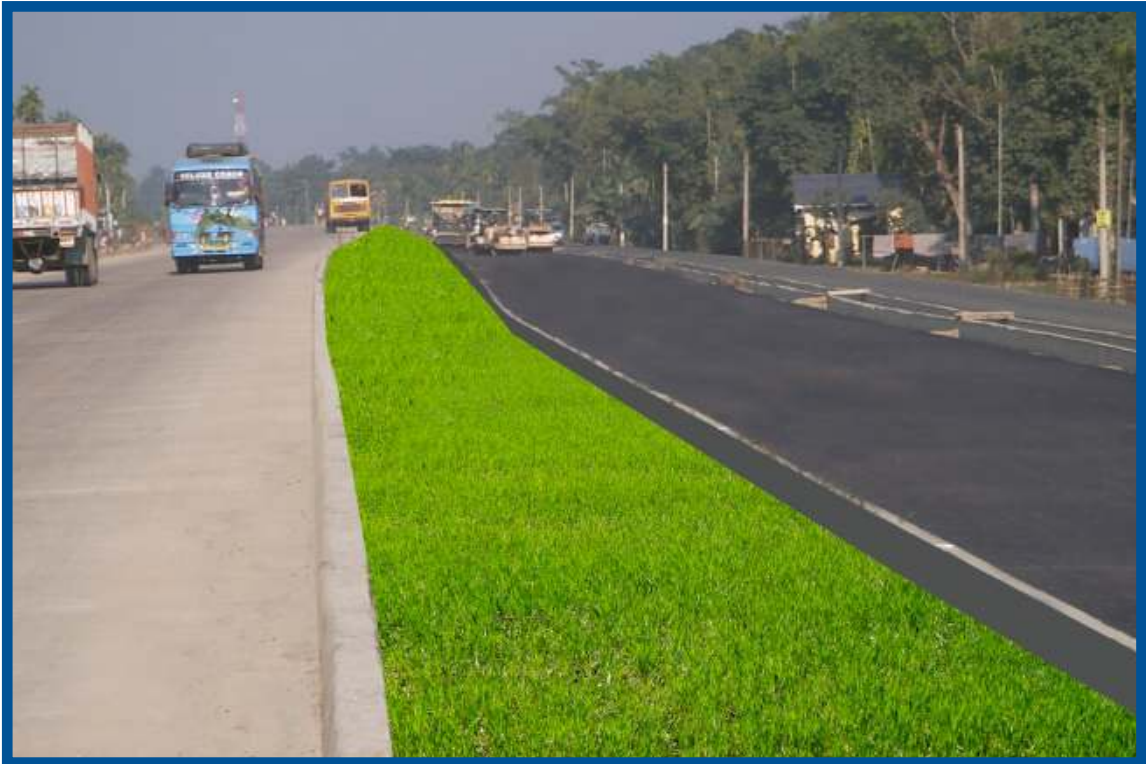
Completed Rigid pavement in AS-18 Package, Assam