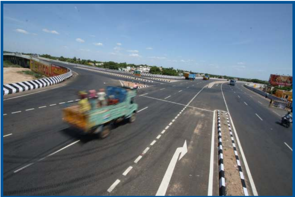
Completed Highway junction in NS-39 Package, Tamil Nadu