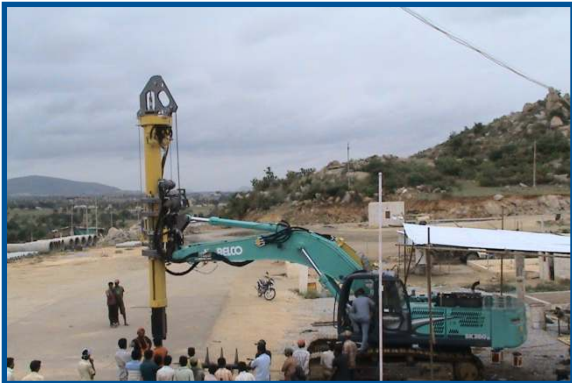
Lo Drill-DH-60 Piling Machine