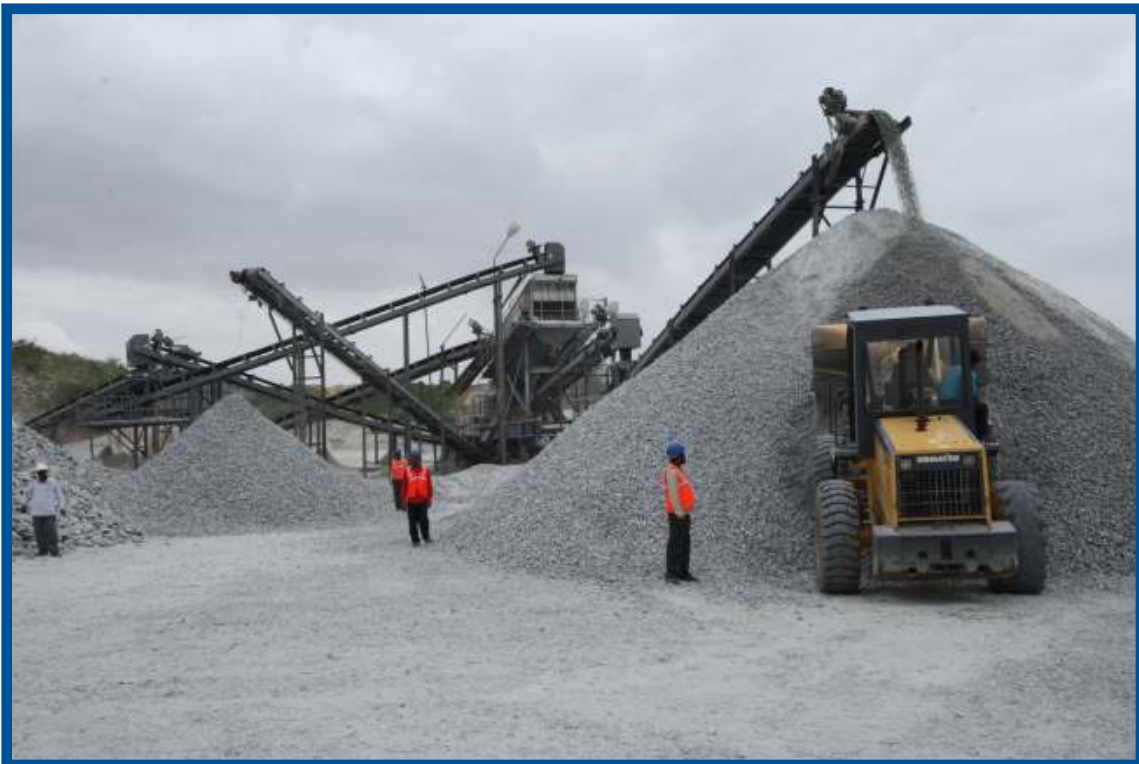
250 TPH Nawa Crushing Plant at KNT-01 Package, Karnataka