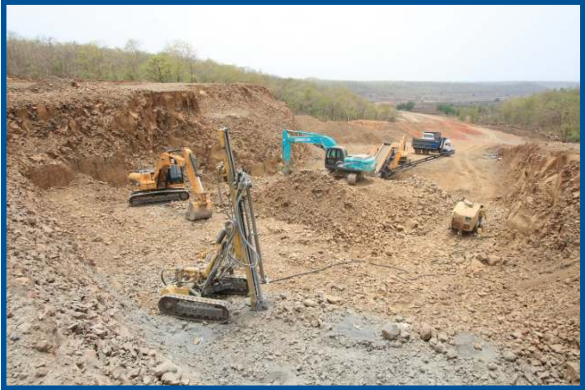
Cat excavators & rock drilling machines in mining operation