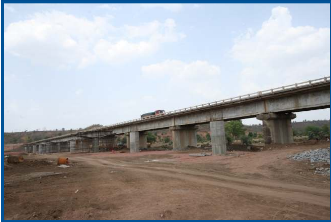
Completed river bridge (430 Metres Length) in NS-39 Package, Tamil Nadu