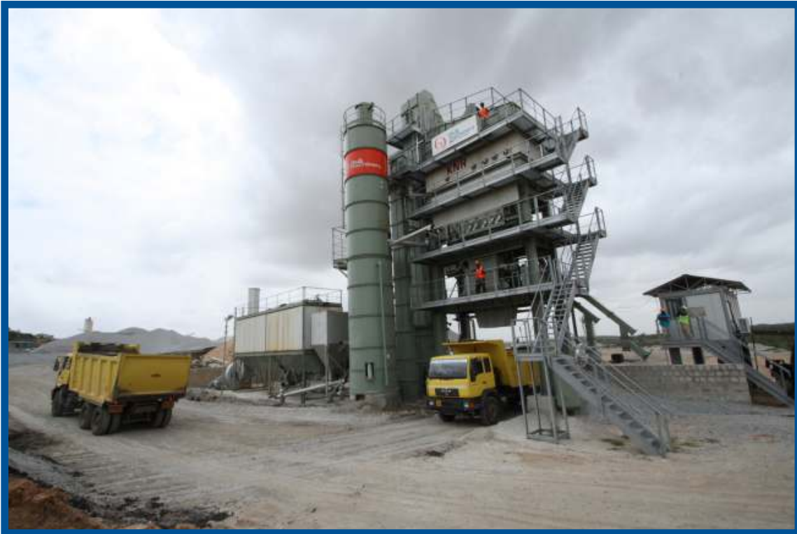
240 TPH D & G Hot mix plant at Bangalore, Karnataka