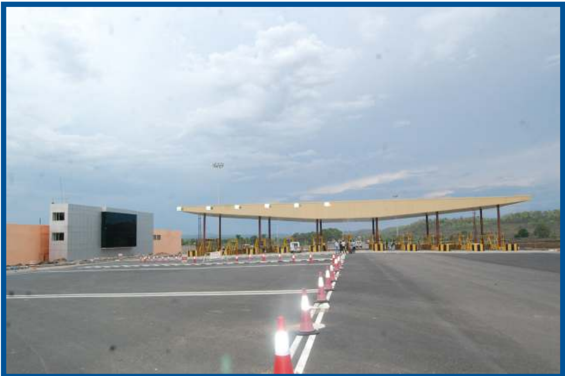
Completed Section & Toll Plaza in AP-07 Package, Andhra Pradesh