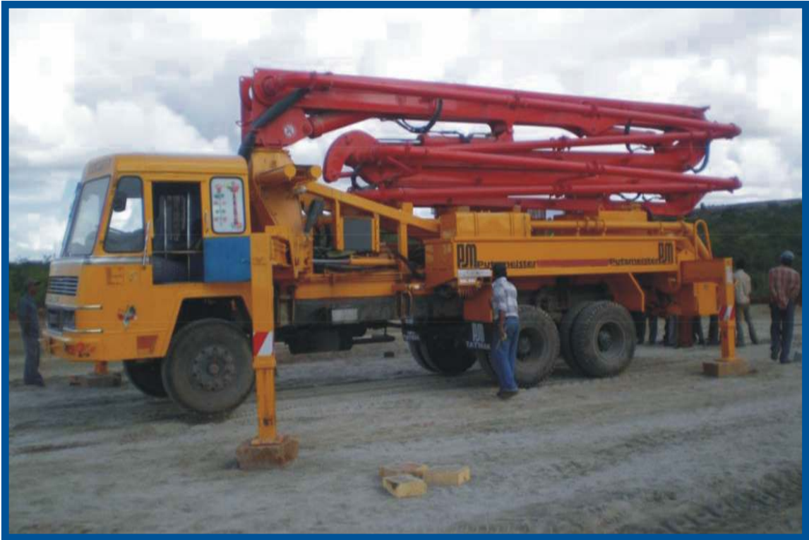
Rig Putzmeister concrete boom placer