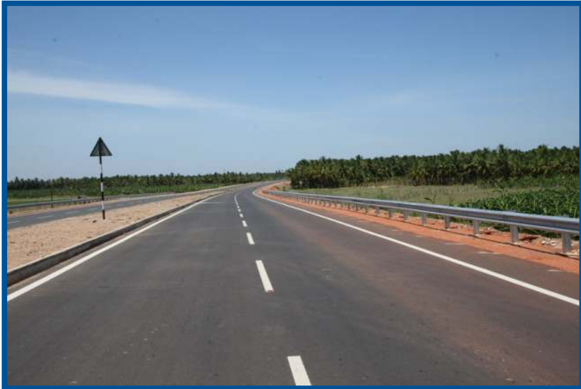
Completed stretch of 4 laning of AP-11 Package, Andhra Pradesh