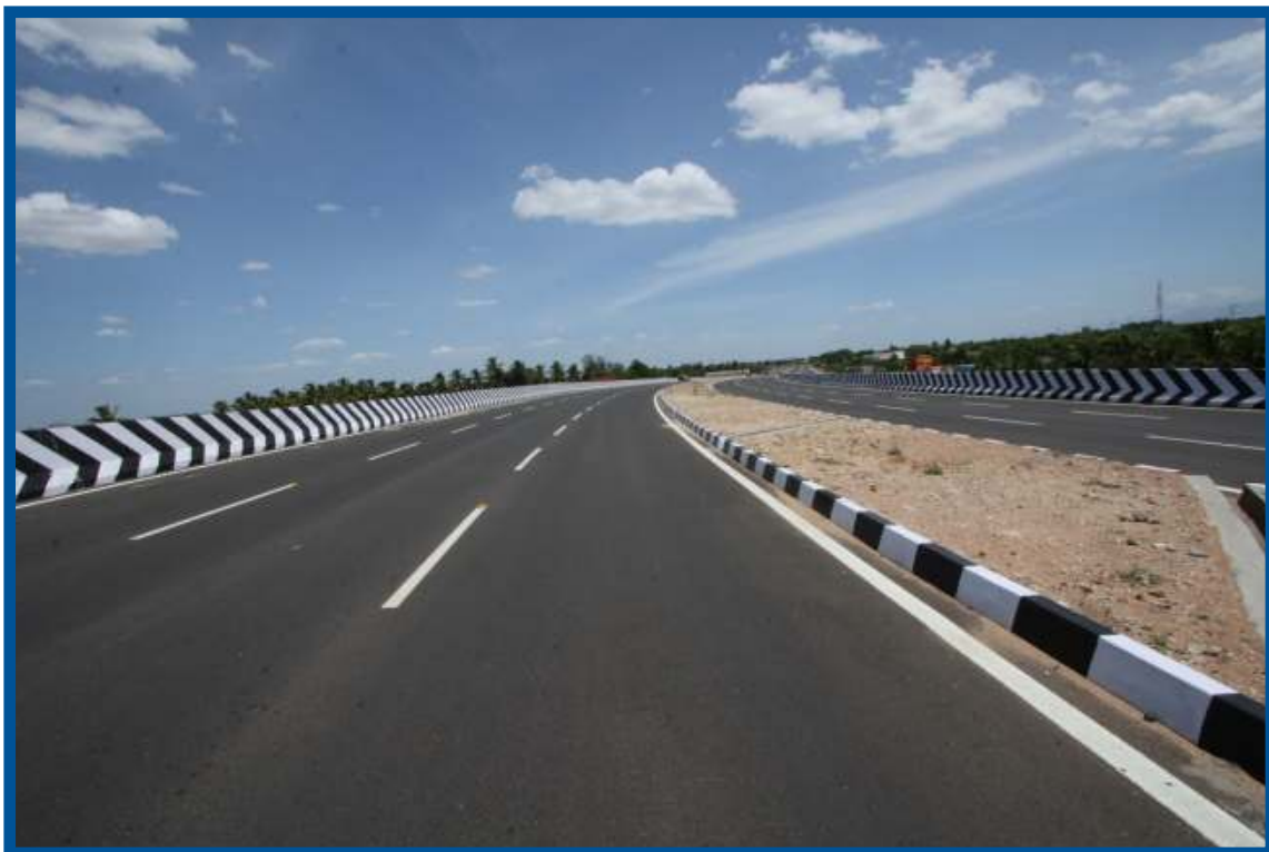
Completed stretch of 4 laning of NS-43 Package, Tamil Nadu