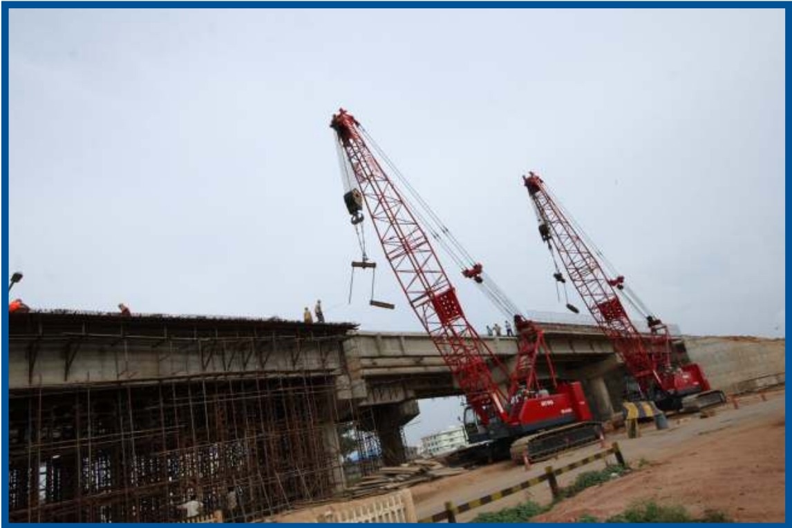
100MT Cranes in operation in Urban Infrastructure work near Bangalore